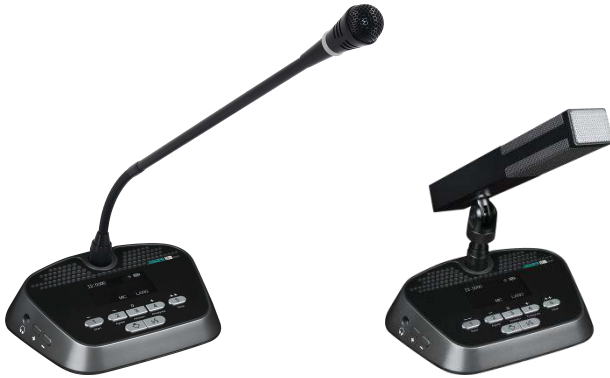
D7321 5G WiFi Encrypted Wireless Speaking & Voting Chairman Unit