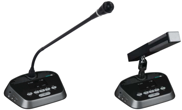
D7322 5G WiFi Encrypted Wireless Speaking & Voting Delegate Unit